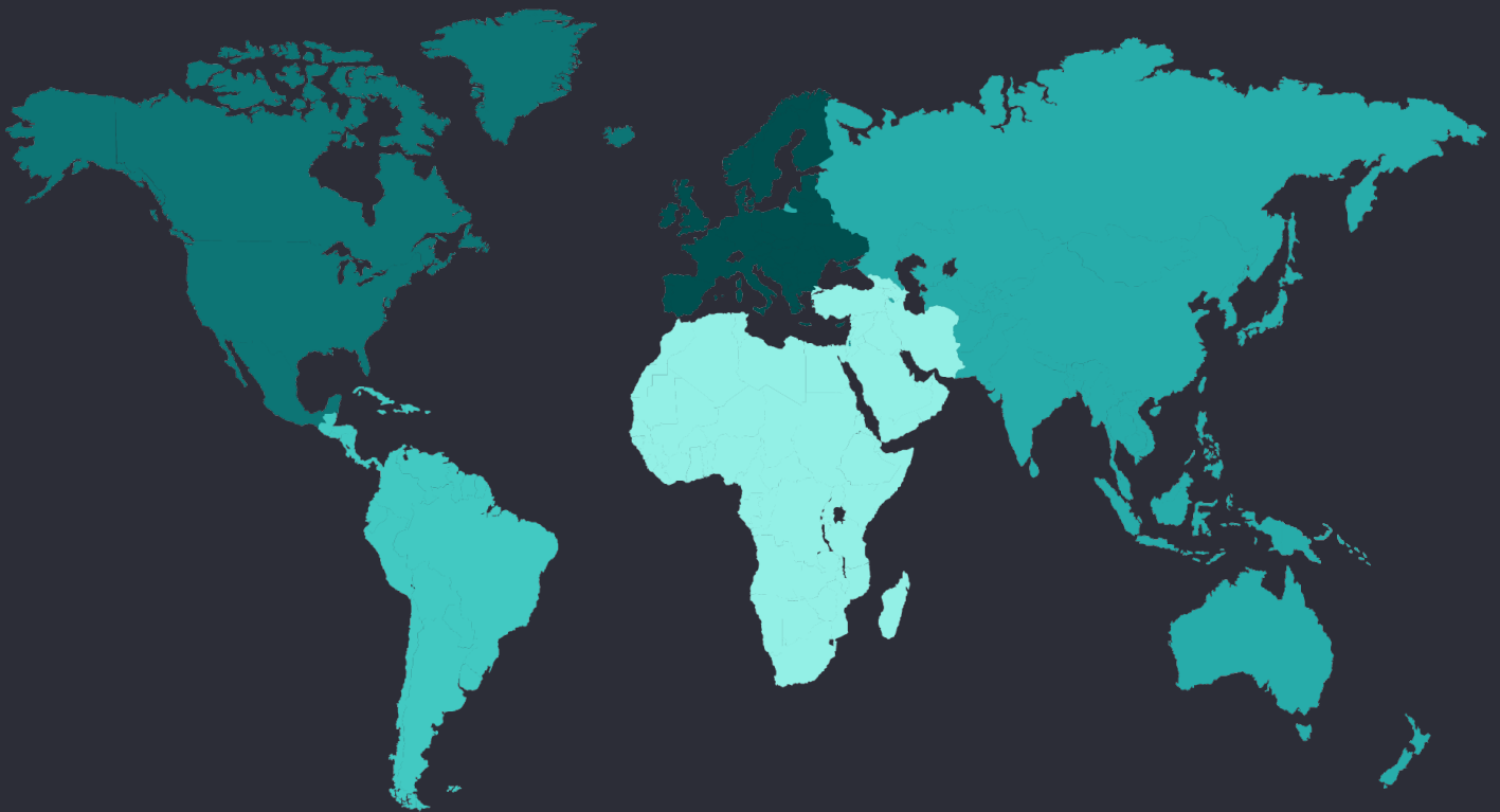
Heatmap of GIIA member assets by continent

59 infrastructure investors $940bn of AUM, invested in 1,700 infrastructure assets, across 66 countries